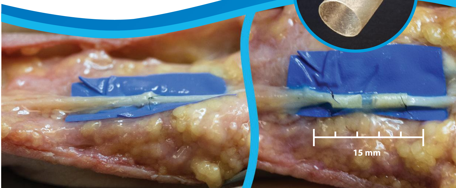
Extension of finger after direct repair shows tension along the length of the nerve.